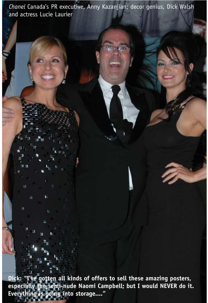
Dick: "I've gotten all kinds of offers to sell these amazing posters, especially the semi-nude Naomi Campbell; but I would NEVER do it. Everything is going into storage...."